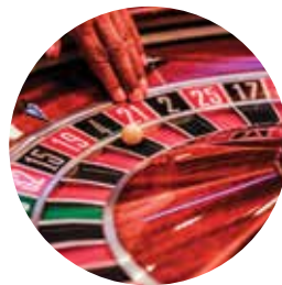
Gambling in Casinó Portorož