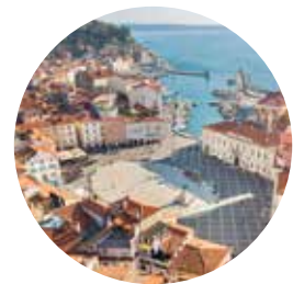
Visit of a cultural points in Piran