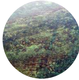
Remains of a Roman road under water