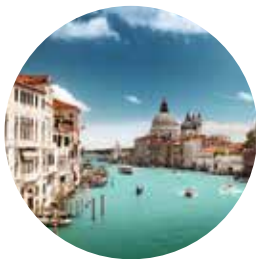
Trip to Venice