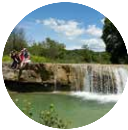
Natural park Dragonja